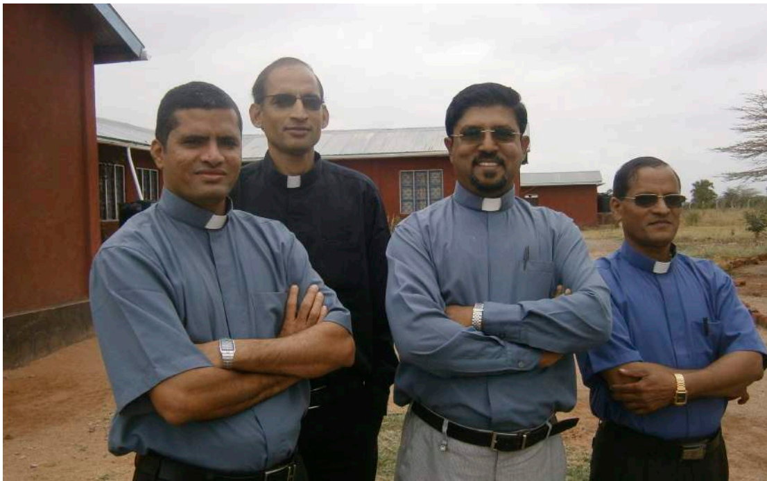
The Headmaster, H.R. Director, School Manager & Life Skill Trainer