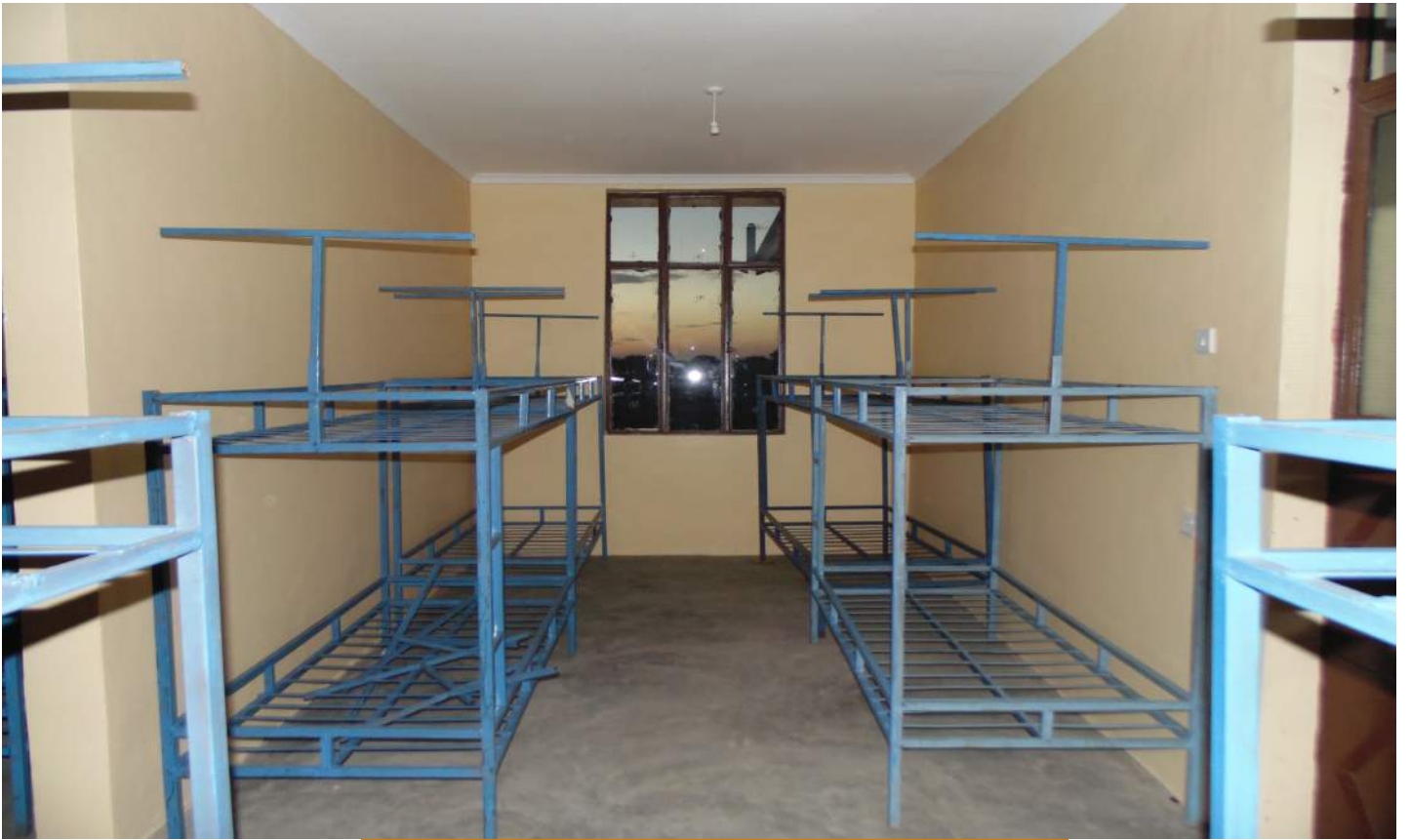
Form I – Dormitory cots