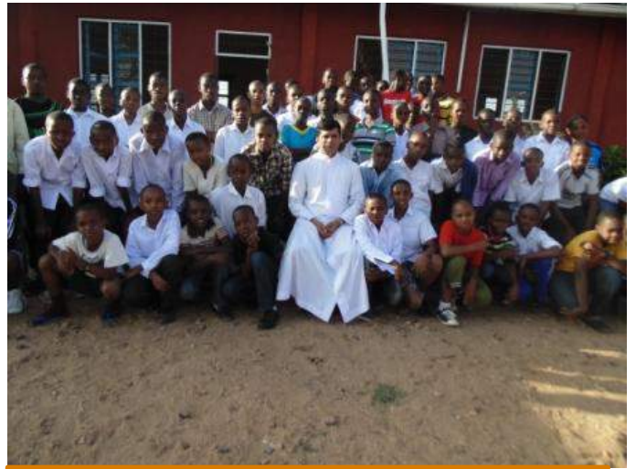
Headmaster with the Form I Students