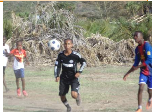
Students playing Football