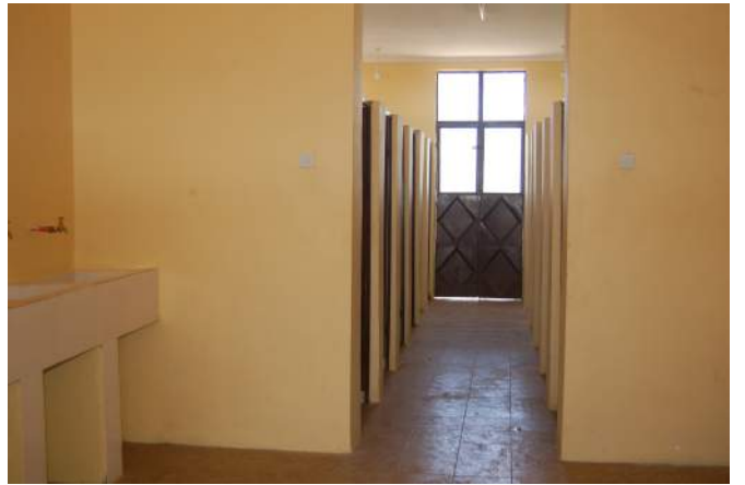
Form I - Dormitory – Water Closet