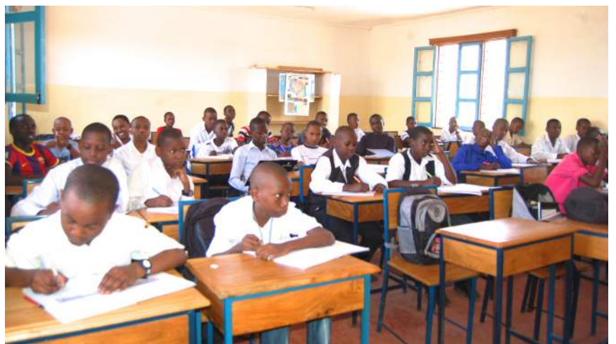
Form I – Class in progress (2014)