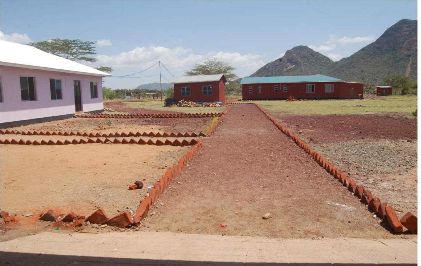
The partial view of the 20 acres St Joseph School Campus